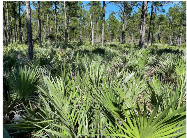
Pine rocklands with overly dense saw palmetto to undergo restoration.